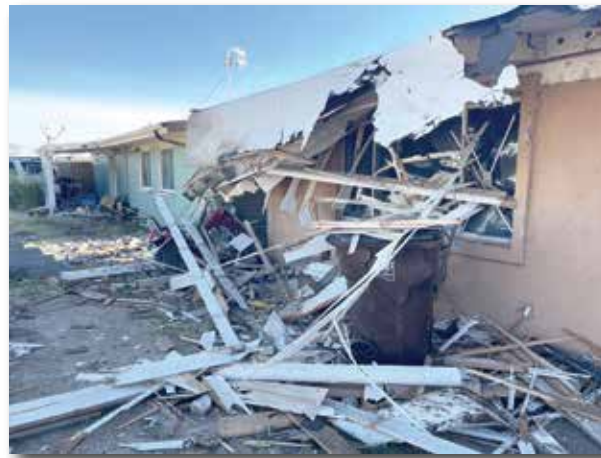
House on the corner of Webb Dr. and Giffen Rd. was damaged during a suspected drag racing incident.

She also said that starting Jan. 9, deputies began conducting a focused traffic enforcement detail in San Manuel. "Our goal is to show a heavy presence in the area," she said.