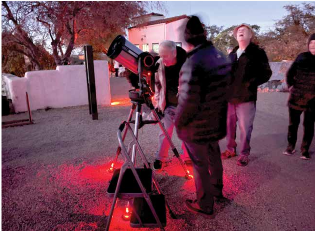
Amateur astronomers set up telescopes at the January Star Party at the Oracle State Park.

Once the presentation was over, and the sun was set, the Tucson Amateur Astronomer Association was outside with multiple high end telescopes. People were allowed to see views of the moon, Venus, Mars, and more. Be sure to visit the Oracle State Park's website and see what other events they'll be hosting in 2025!