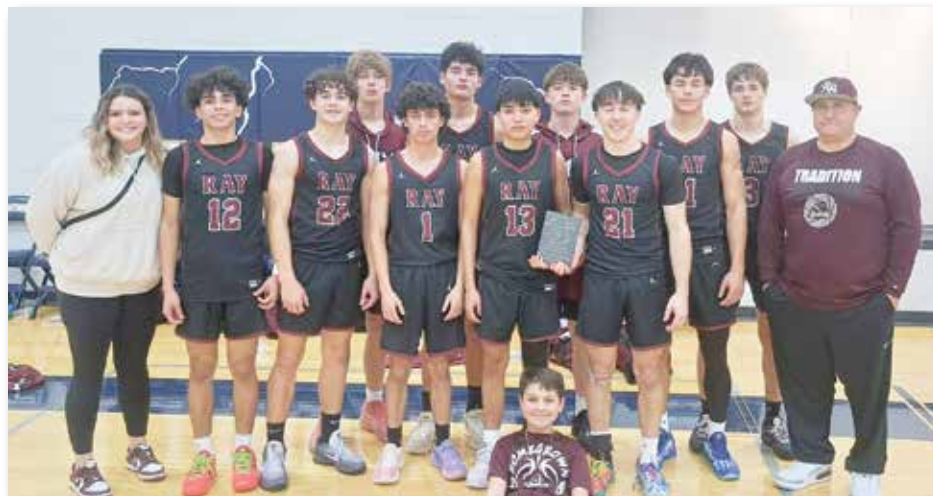
Ray Bearcats 2024-25 Varsity Basketball Team, runners up in the Epic Tourneys New Years Classic.

Both teams will host Ray on Wednesday, Jan. 15, with the girls game starting at 5:30 p.m. and the boys game at 7 p.m. They will both host Superior the following day, with the same start times. On Friday, they will travel to take on