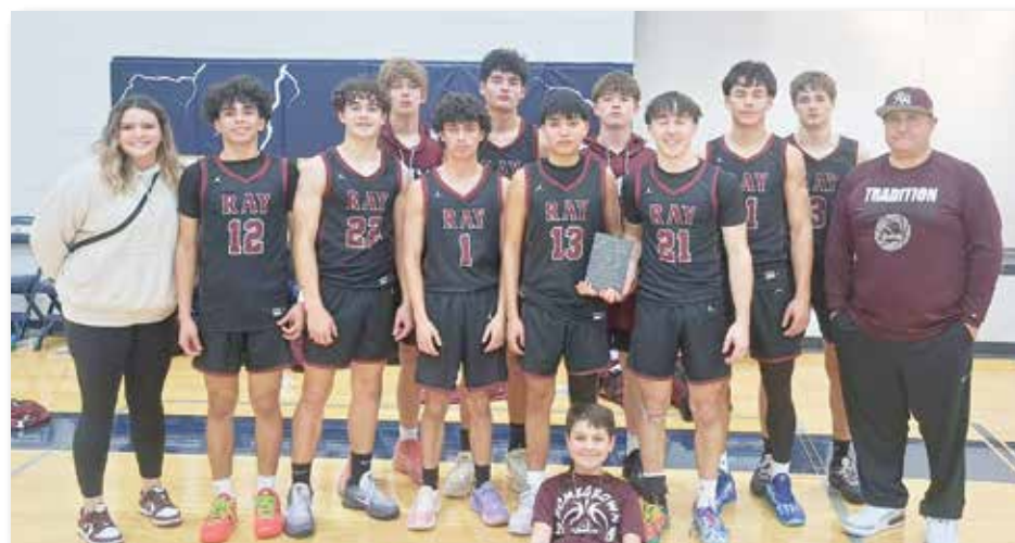
Ray Bearcats 2024-25 Varsity Basketball Team, runners up in the Epic Tournaments New Years Classic.

Both teams will host Ray on Wednesday, Jan. 15, with the girls game starting at 5:30 p.m. and the boys game at 7 p.m. They will both host Superior the following day, with the same start times. On Friday, they will travel to take on Valley Lutheran.