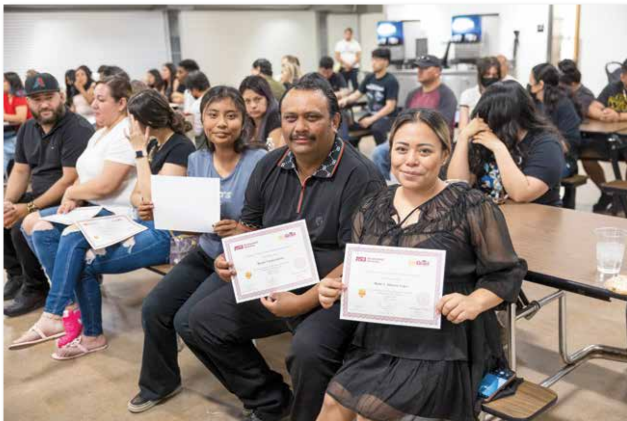
WeGrad participants' graduation.

As kids develop, the discussions can certainly become more complex and build upon the foundational knowledge already shared. The goal is to make education, and a trusted relationship between parent and child, the cornerstones of painting a successful future together. To help shape your child's educational future, enroll in WeGrad today. With a curriculum delivered via text messages suited for elementary, middle and high school families, it's a simple and efficient way to support your student's academic journey. Visit WeGrad.asu.edu/digital to sign up or learn more.