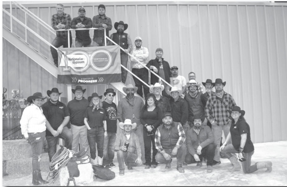
Employees and guests gathered to celebrate Gold Bond's centennial.

in hand. Who knew these mountains held gypsum of such remarkable quality—fueling industries far beyond our town? La Posada in Tucson, the Omni Hotel in Tempe, and the new Foothills Mall in Tucson were built strictly using gypsum from our Gold Bond Plant here in Dudleyville."