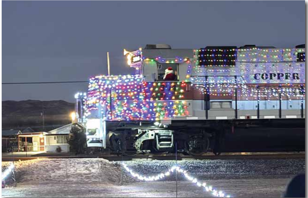
Santa Claus arrives at the Kearny Elks aboard the Polar Express (known at other times of the year as the Copper Basin Railway). The man in red visited with families who enjoyed refreshments and activities.