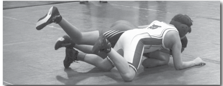
A Mountain Vista wrestler works to get the pin at the Al Trejo Wrestling Classic.