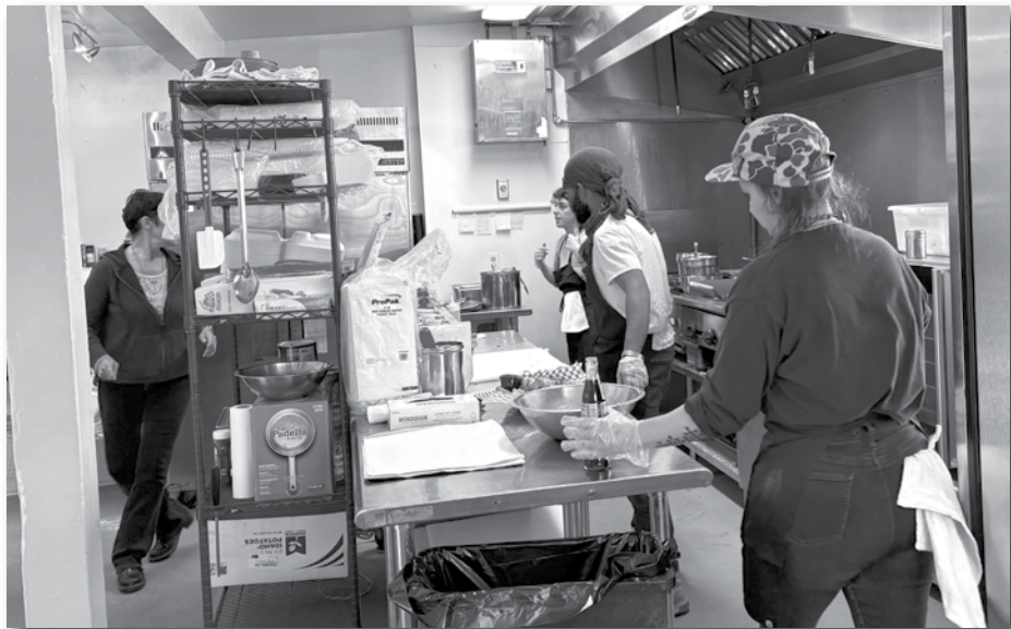
A look behind the scenes at the Riot Grill in Oracle.

Fries which can be loaded with a choice of toppings. Be sure to stop into Riot Grill and come try some of their delicious food, and support one of Oracle's newest businesses.