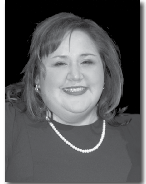
Superior Mayor Mila Besich

The ceremony and reception were held at the headquarters of the National Bank of Arizona in Phoenix.