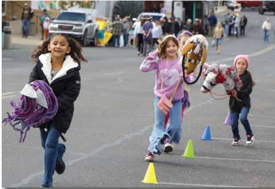
Donkey stick races at the annual burro run.