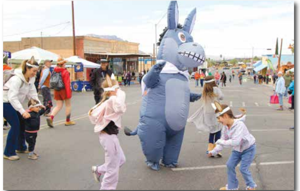
CASA of Pinal County brought an inflatable donkey. The group is a huge supporter of the event.