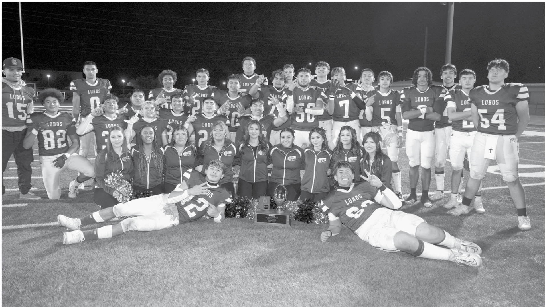
Hayden football team and cheerleaders celebrate the team's second state championship in two years. Way to go, Lobos!

During the start of the third quarter, the Lobos were set to receive the kickoff. After