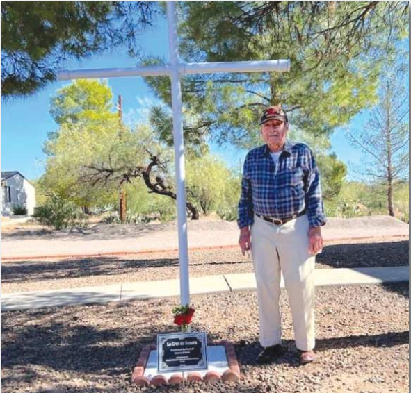
The Sonora Historical Marker was erected on May 5, 1999, by members of El Club Sonorense. Its members were former residents of Sonora. That day coincided with the last Cinco de Mayo of the 20th Century. Earlier this month, a celebration was held at Infant Jesus of Prague Catholic Church for the marker's new home.