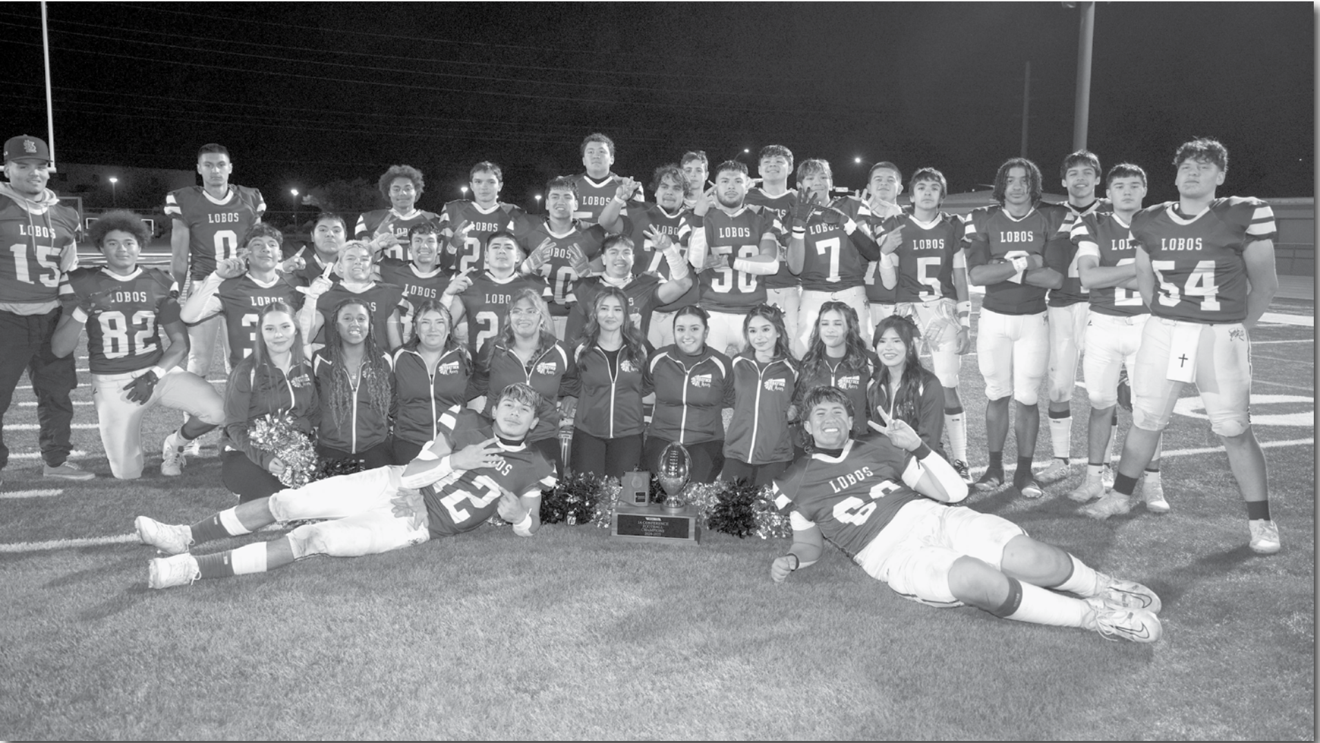
Hayden football team and cheerleaders celebrate the team's second state championship in two years. Way to go, Lobos!