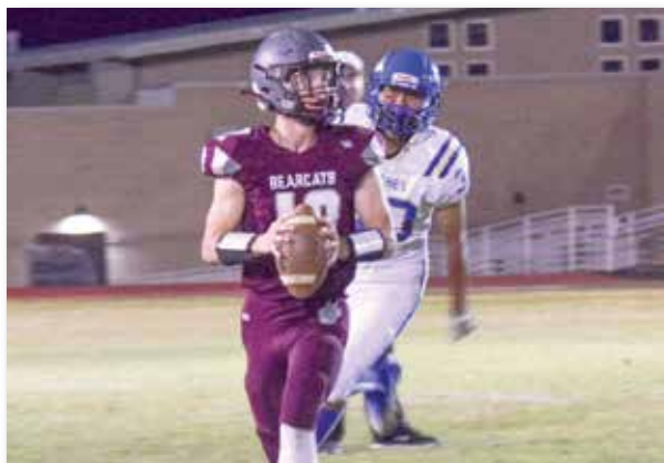
A Ray player looks for an opening.