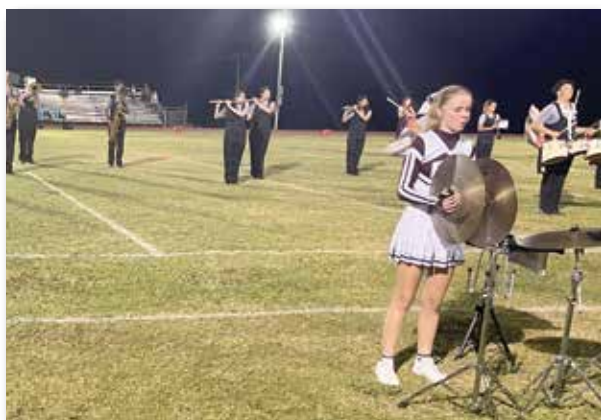
The Ray Marching Band performs at halftime.