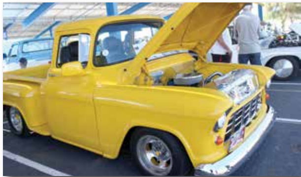
Les Spangle's Chevy 3100.