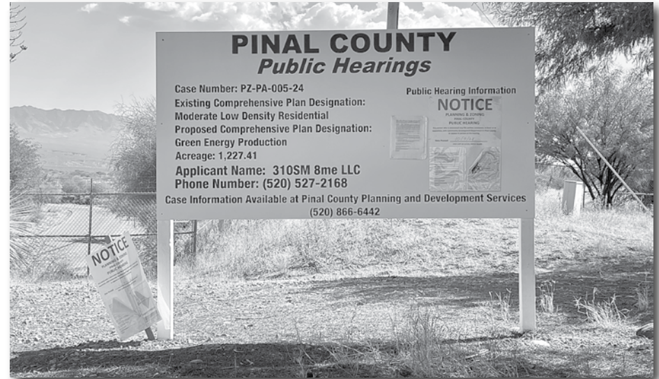
Highway Sign along BHP property line announces the public hearing.