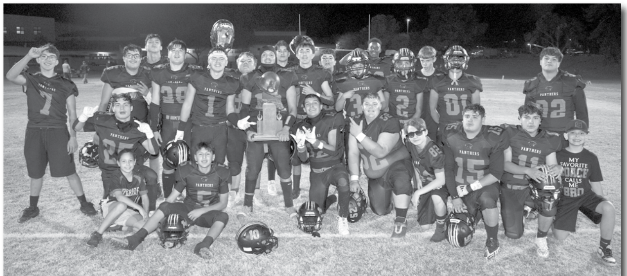
The Superior team celebrates with the Copper Helmet.