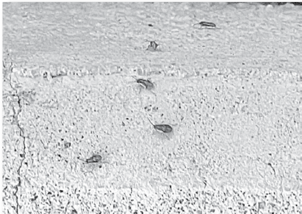
False Chinch bugs can be found in and around San Manuel.