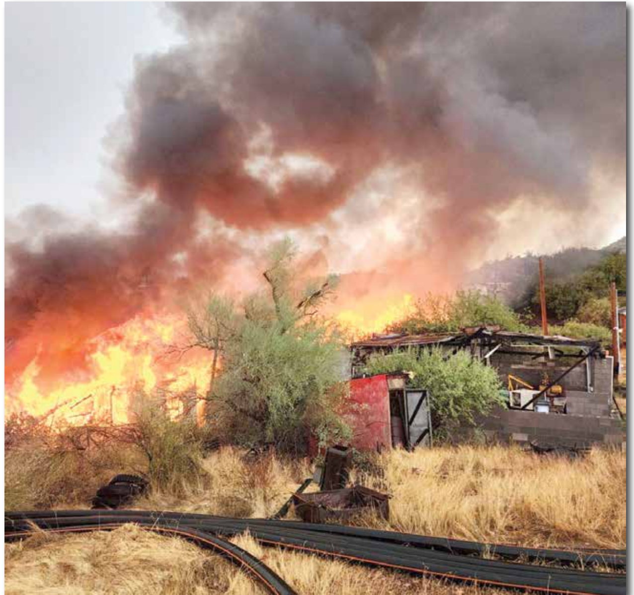
Dew Fire near Riverside burned two abandoned structures.