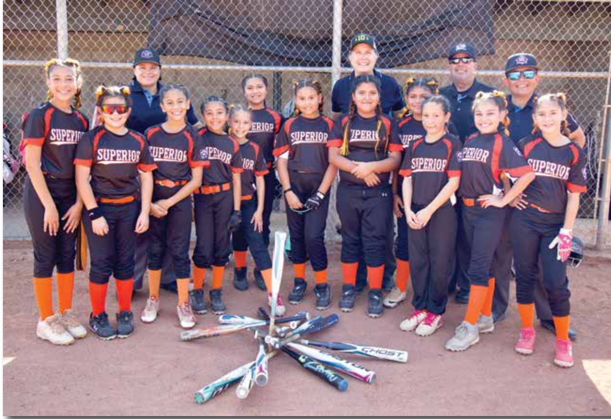
The Superior 8-10 All Stars pose for a photo with the umpires.

The Superior 8-10 All Stars team did a great job this season and represented their town with pride. The community of Superior is proud of these dedicated girls! We'll see you on the diamond next season.