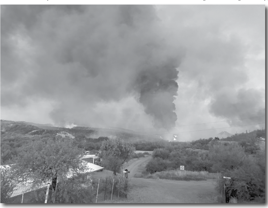
The Simmons Fire rages through the community of Riverside.

At press time, the fire consumed 351 acres and is 85% contained with no new growth being reported. The Type Three team was released from the fire and the Arizona Department of Forestry and Fire Management have regained command of the fire.