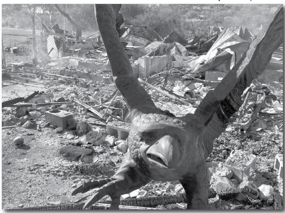
The Simmons Fire left a swath of devastation through the Riverside community.