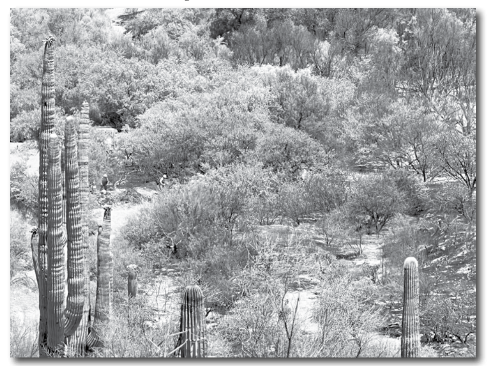
Fire crews check for hot spots after the Simmons Fire burns away from the area.