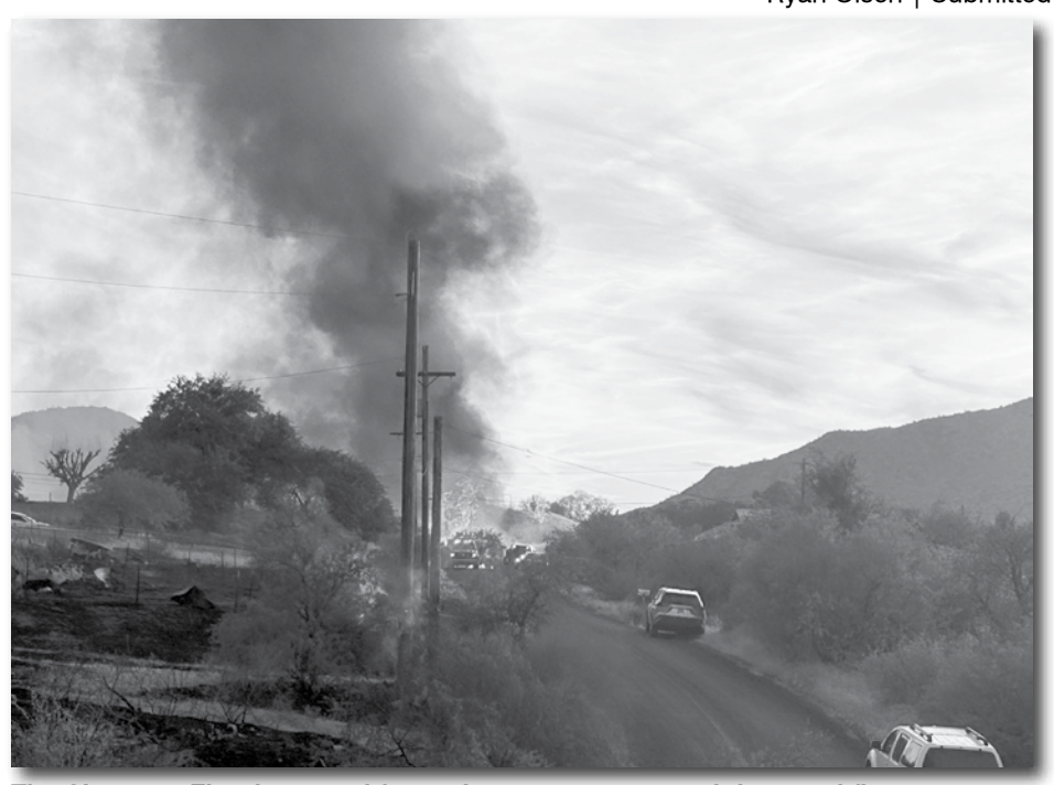
The Simmons Fire destroyed four primary structures and damaged five more. Ryan Olsen | Submitted