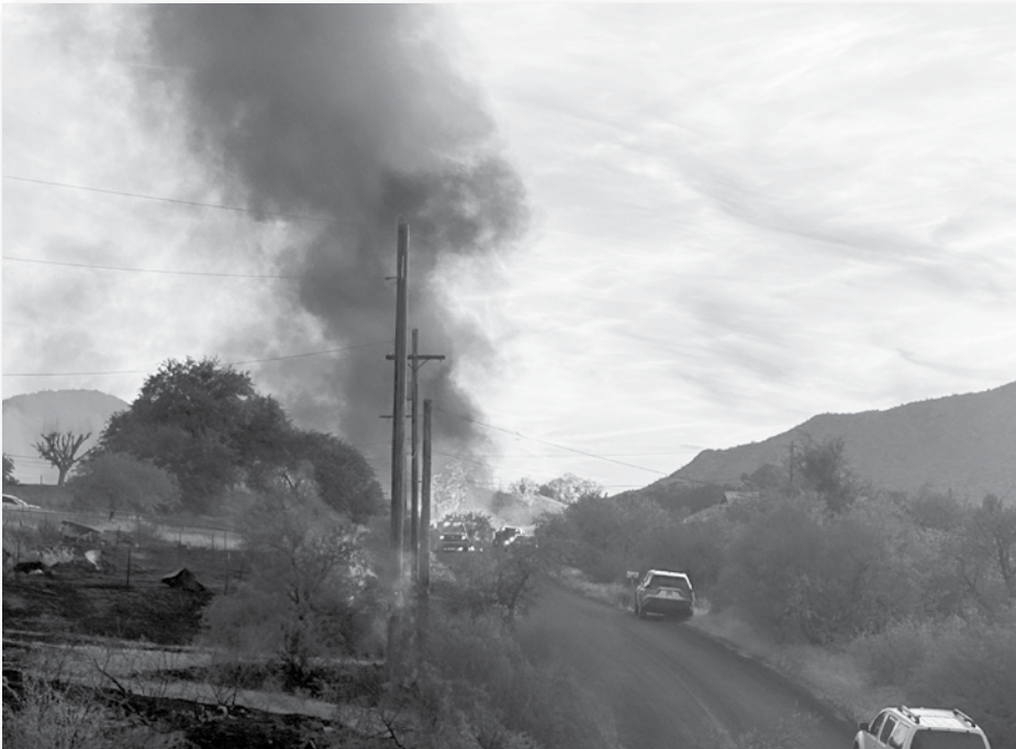
The Simmons Fire destroyed four primary structures and damaged five more.