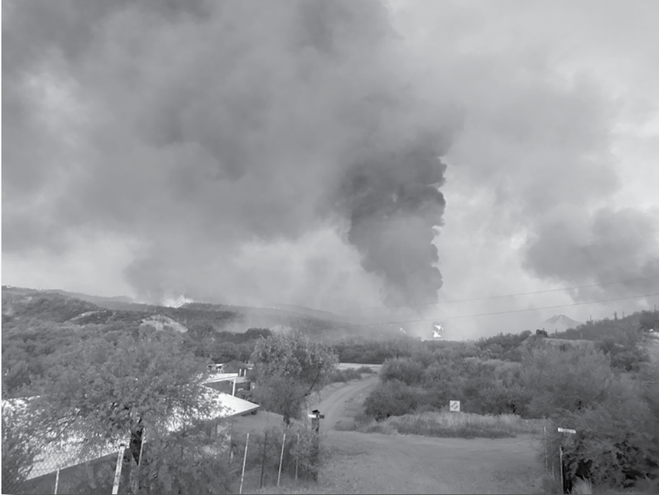
The Simmons Fire rages through the community of Riverside.

At press time, the fire consumed 351 acres and is 85% contained with no new growth being reported. The Type Three team was released from the fire and the Arizona Department of Forestry and Fire Management have regained command of the fire.