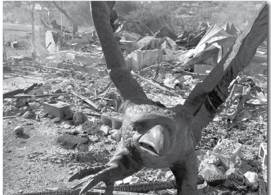
The Simmons Fire left a swath of devastation through the Riverside community.