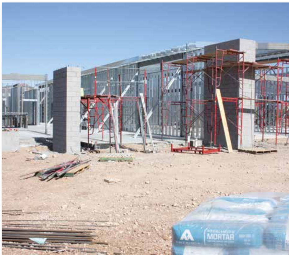
Construction is continuing at a rapid pace on the new Kearny Clinic.