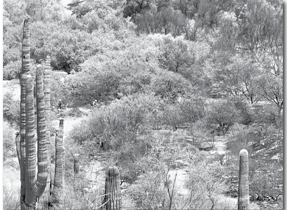
Fire crews check for hot spots after the Simmons Fire burns away from the area.