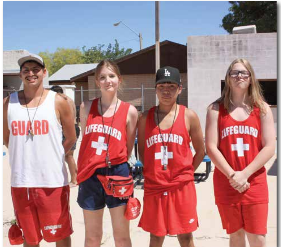
With the temperatures getting hotter, a dip in the Kearny pool is a way to be cool.