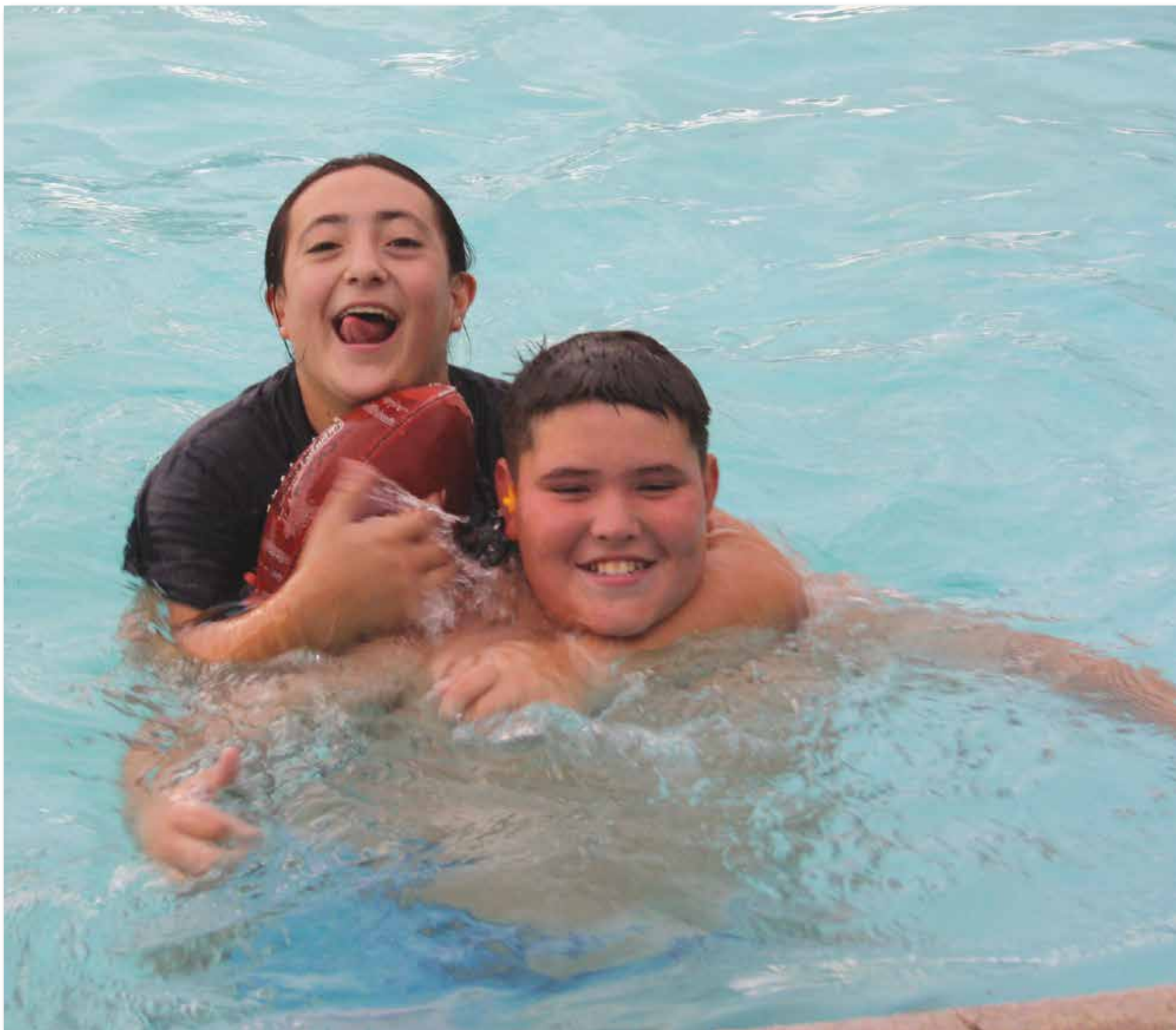
The Hayden Pool is open for kids of all ages to cool off during the hot, hot summer! J