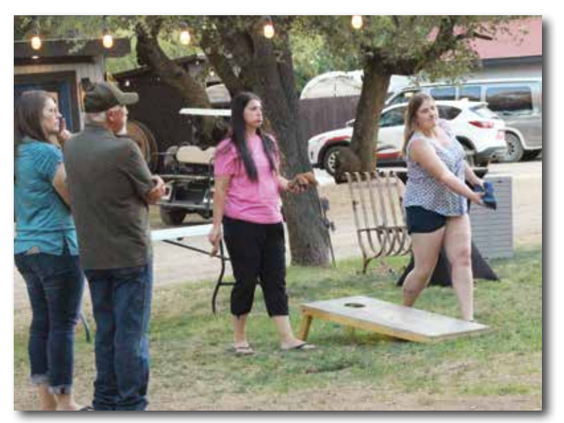
Food, fun and fellowship at the El Rancho Robles Food Truck Friday. Folks played corn-hole, visited with neighbors and enjoyed some great food and music.

Be sure to keep an eye out for more Food Truck Fridays, and other events that are happening at El Rancho Robles. You can keep up with them on social media, such as Instagram and Facebook, or check out their website: elranchorobles.com