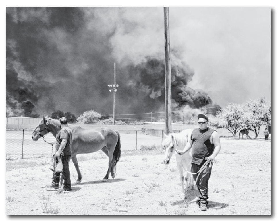
The Arizona Department of Forestry and Fire Management has issued Stage 1 Fire Restrictions for most of the state.